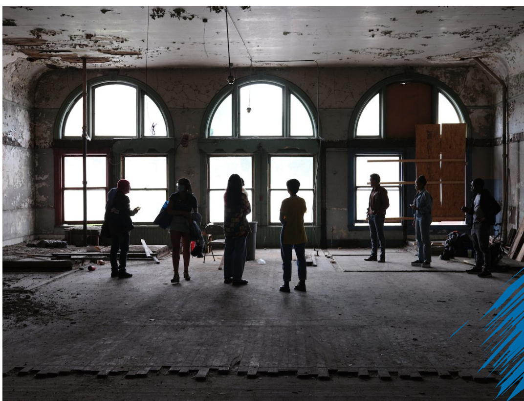
The Center in Braddock is shaping up.